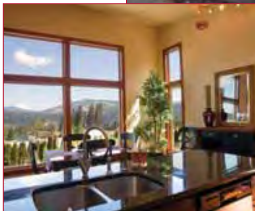
These Clearwater Townhomes are for sale through RE/MAX Results and currently rented through Gorge Rentals.

Most, if not all, of the homes managed by Gorge Rentals in Hood River during June to August are filled